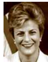
Ileana Ros-Lehtinen welcomed in Key West