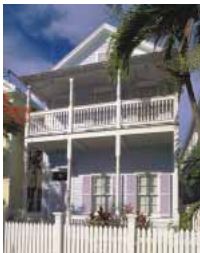
Key West Office at 615 1/2 Whitehead Street.